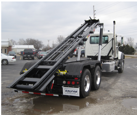
Cable & Hook Hoists

The Hooker is compatible with Galfab's entire line of hoists, containers and trailers.