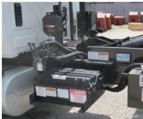
Outside Controls and Reservoir