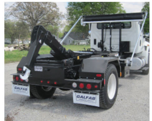
Steel Fenders with Tarp System Option