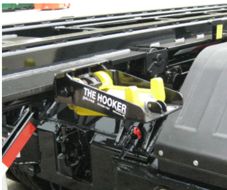
Optional "The Hooker" Securement System