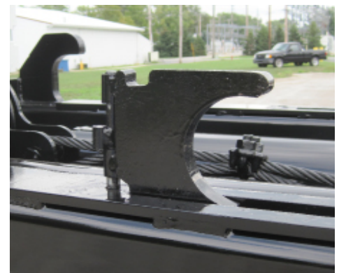
Auxiliary Fold Down Stops