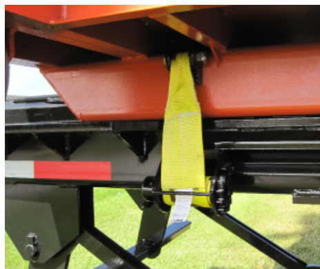
Sliding Ratchet Tie Down Straps