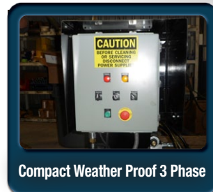
Compact Weather Proof 3 Phase