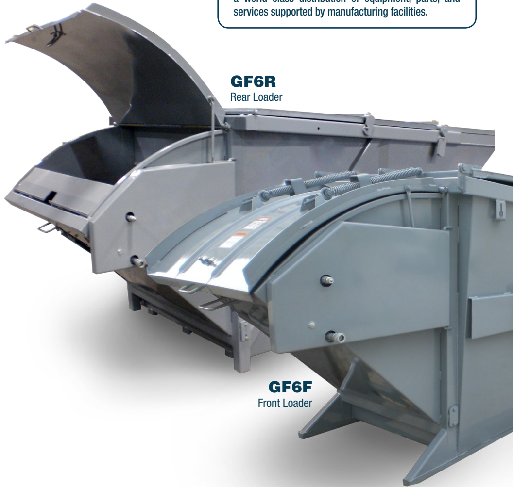
GF6R Rear Loader

Galfab's mission is to provide our customers with a world class distribution of equipment, parts, and services supported by manufacturing facilities.