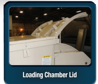
Loading Chamber Lid